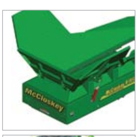
Punch plate, finger deck and bofar bar deck